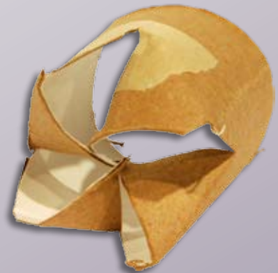
(modified toilet paper tube)

Design and build objects that spin, fly, or float in unusual ways.